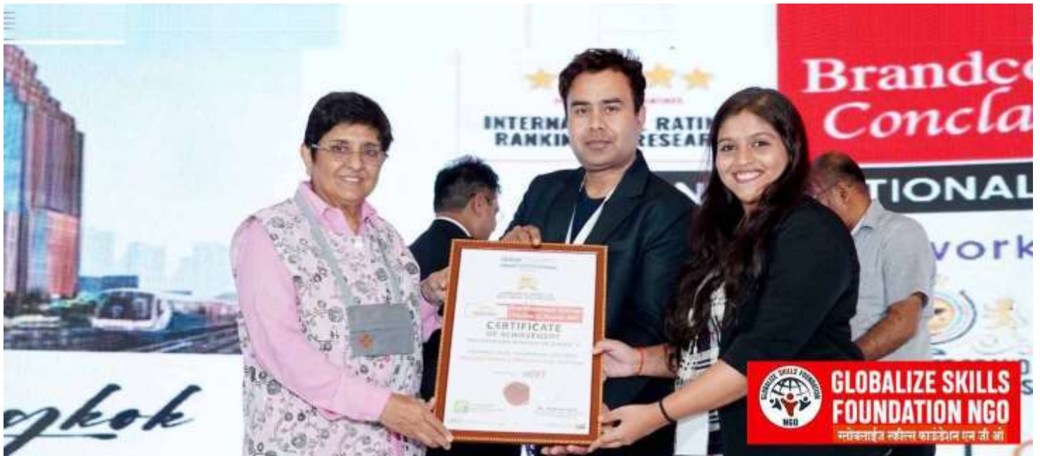
GSF NGO- Co Founders awarded by 1st Female IPS officer, Kiran Bedi